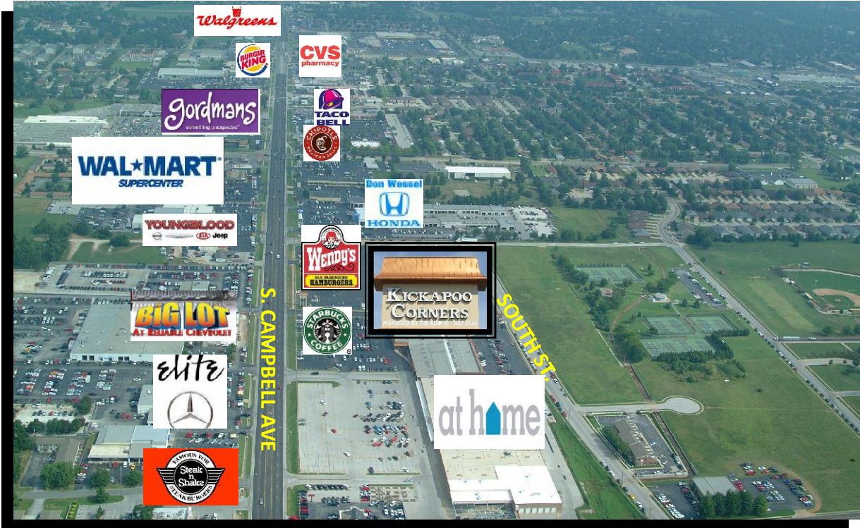
Kickapoo Corners View to the North