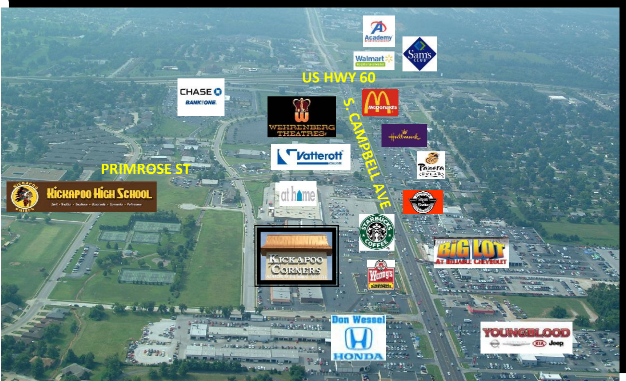
Kickapoo Corners View to the South